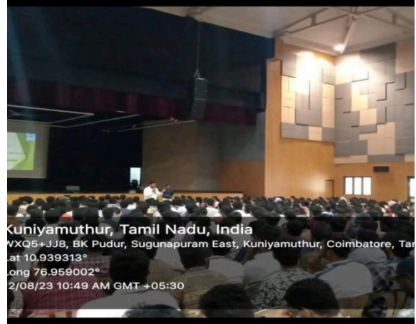
Event 4: How to Prepare for Central