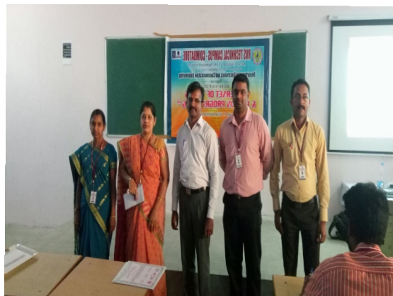
Amirta School of Business