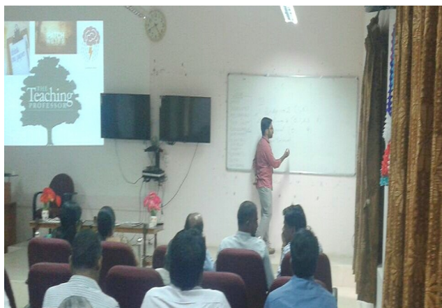
FDP at Bharathiar University