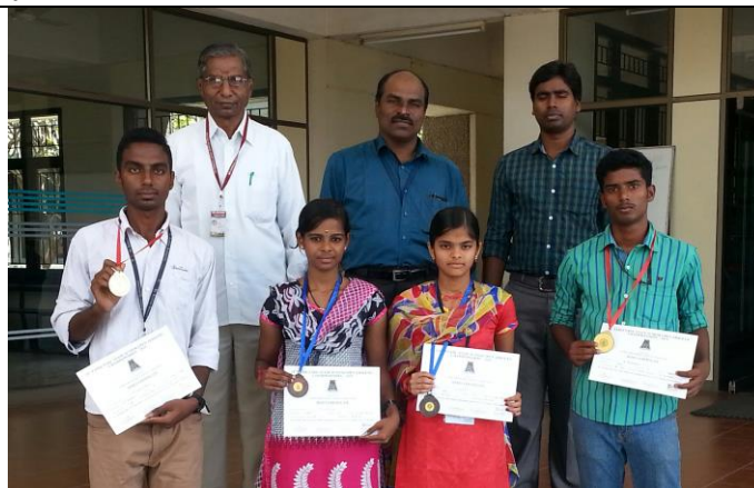
Winners – Junior Athletics