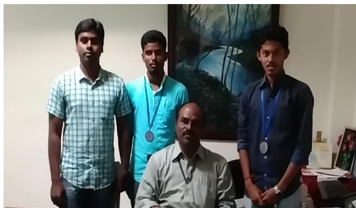
Winners – Athletics