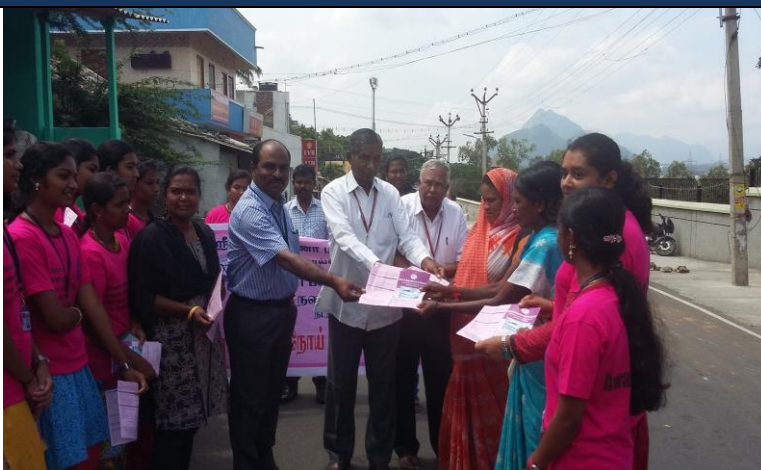
Cancer Awareness Programme – 20.10.2015