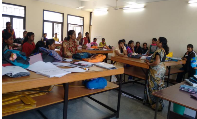
Tutor- Ward Meeting