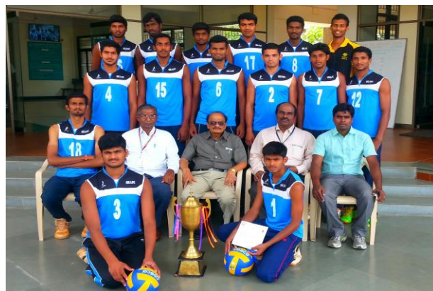
Winners – Volley Ball