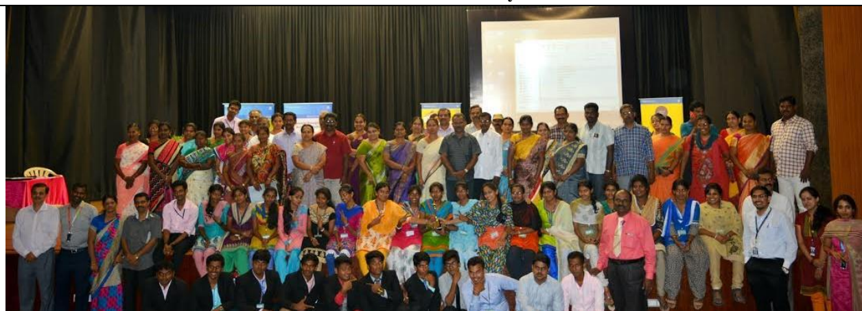
Placement Interface Programme @ B.Com(ABC)