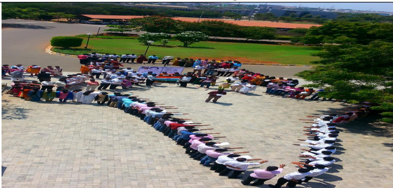
World Students Day