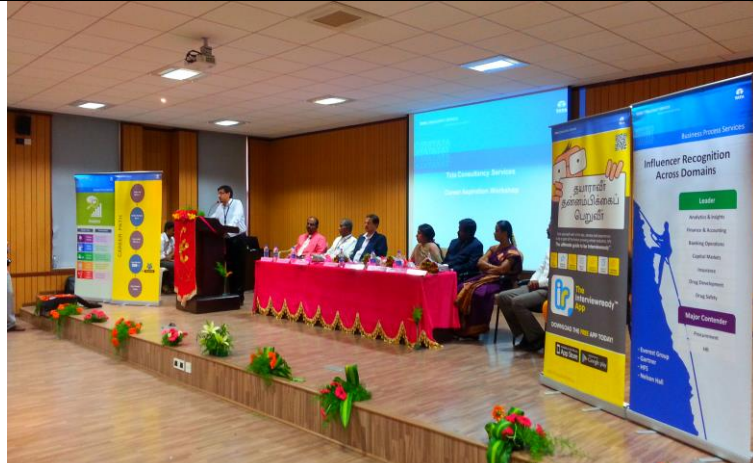
TCS Team Visit – 18.10.2015