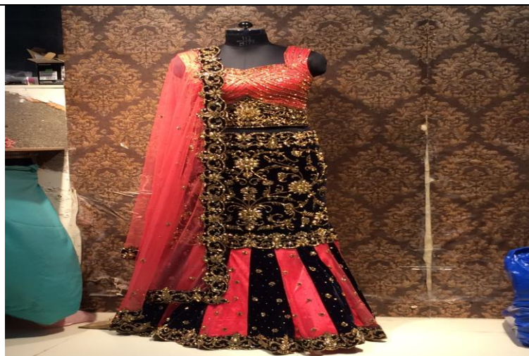
CDF Students Design cum Sale during IET