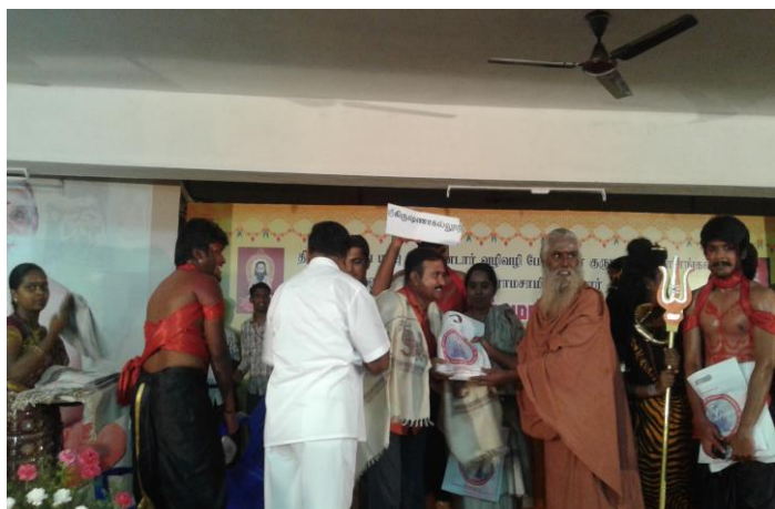
SKASC Students @ Santhalinga Adigalar Programme