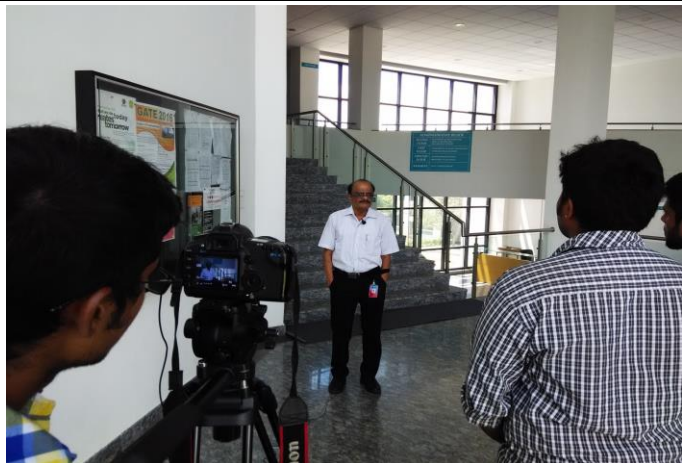
Myclassroom Team Visit – 8.10.2015