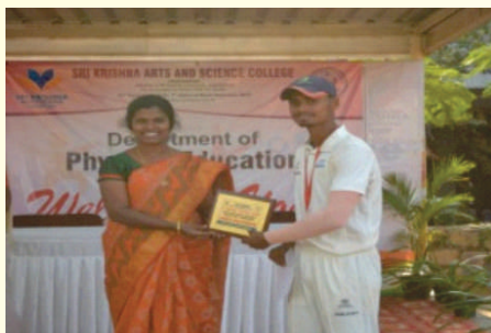
Deccan Chronicle 20th February 2020