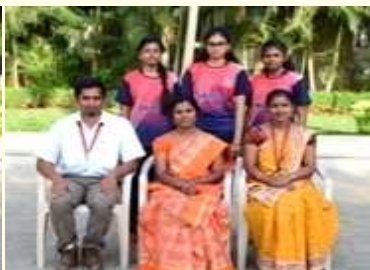
Table Tennis Team