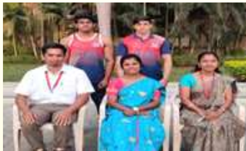
Best Physique Team