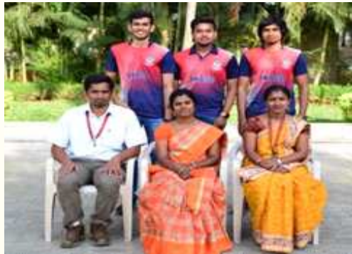
Lawn Tennis Team