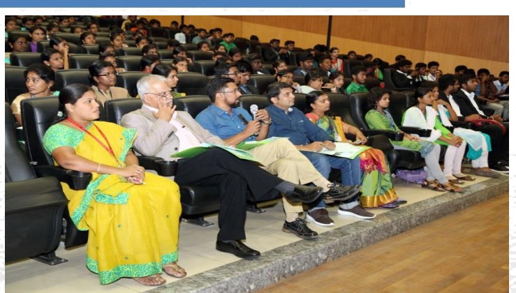
Sri Krishna Arts and Science College