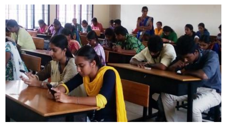
Placement Mock Test @ BCA & M.Sc. SS