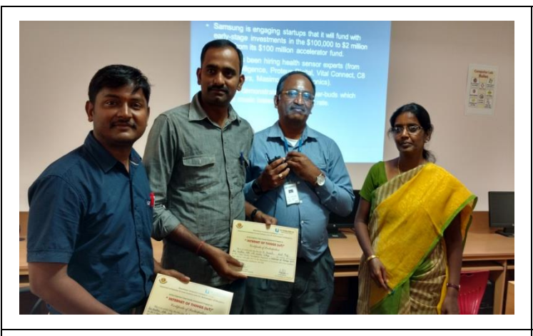
at Auto Callana Halimalant